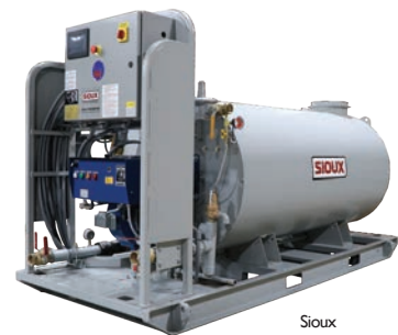
Sioux Water Heater