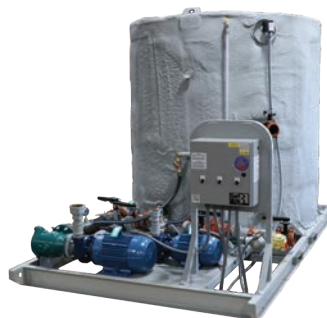
Insulated Water Storage Tank