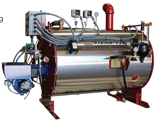
SF-25 NG Fired, Leg Mount